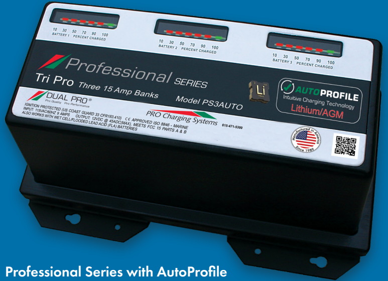
Professional Series with AutoProfile (with 1, 2, 3 or 4) 15 Amp banks