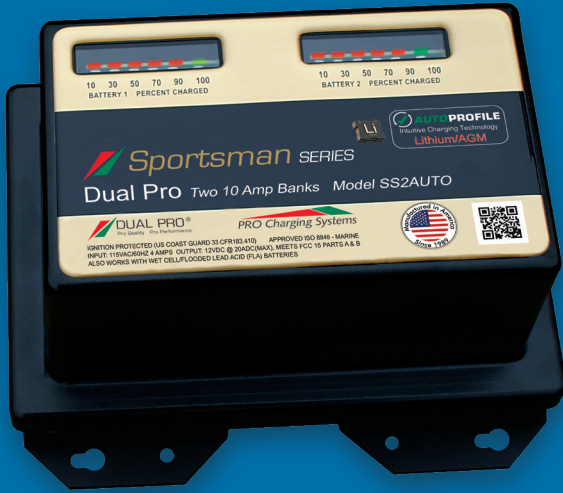
Sportsman Series with AutoProfile (with 1, 2, 3, or 4) 10 Amp banks