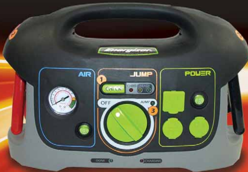
All-In-One - UPG No. 84020