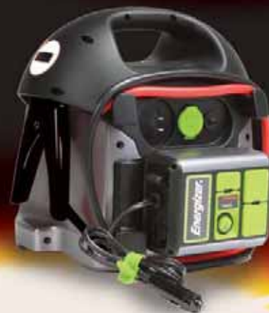
Jumpstart 400 shown with optional 200W Power Inverter*. Inverter Docking Feature for the Jumpstart 400. (*Energizer®200W Inverter sold separately.)

Jumpstart 200 - UPG No. 84021 Jumpstart 400 - UPG No. 84022